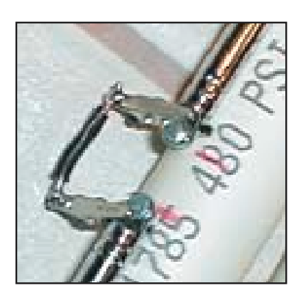
Figure 3—The shorting bar that enables the antenna to be used as a 12 foot vertical.

Tiny metal screws, assorted soldering lugs, jumpers and radial wire (readily available from any halfway decent junk box).