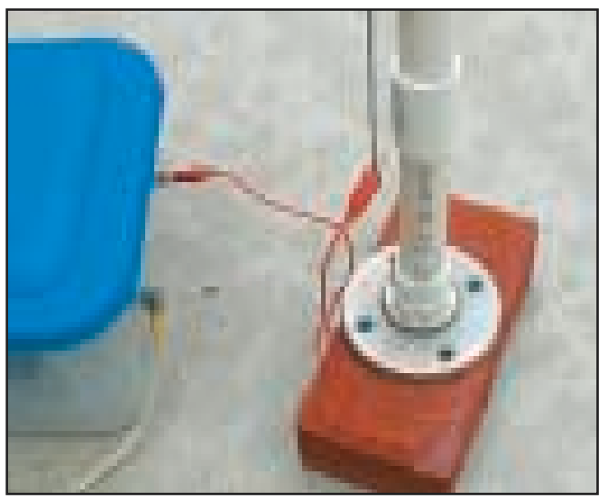
Figure 5—The base and connections to the tuner for operation as a vertical antenna.

Depending on your own circumstances, you can elect to assemble the mast as one piece or cut it into several sections for portability. Instead of a brick base you can devise a clamp or other means to attach the antenna to a railing, gutter, bumper, tripod or other object, depending on the circumstance and the limits of your imagination.