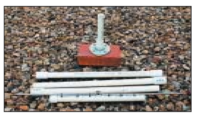
Figure 2—The antenna breaks down easily for storage. Selfsupporting and easy to set up, it weighs 8 pounds including base. No water flows through these pipes—only pure RF.