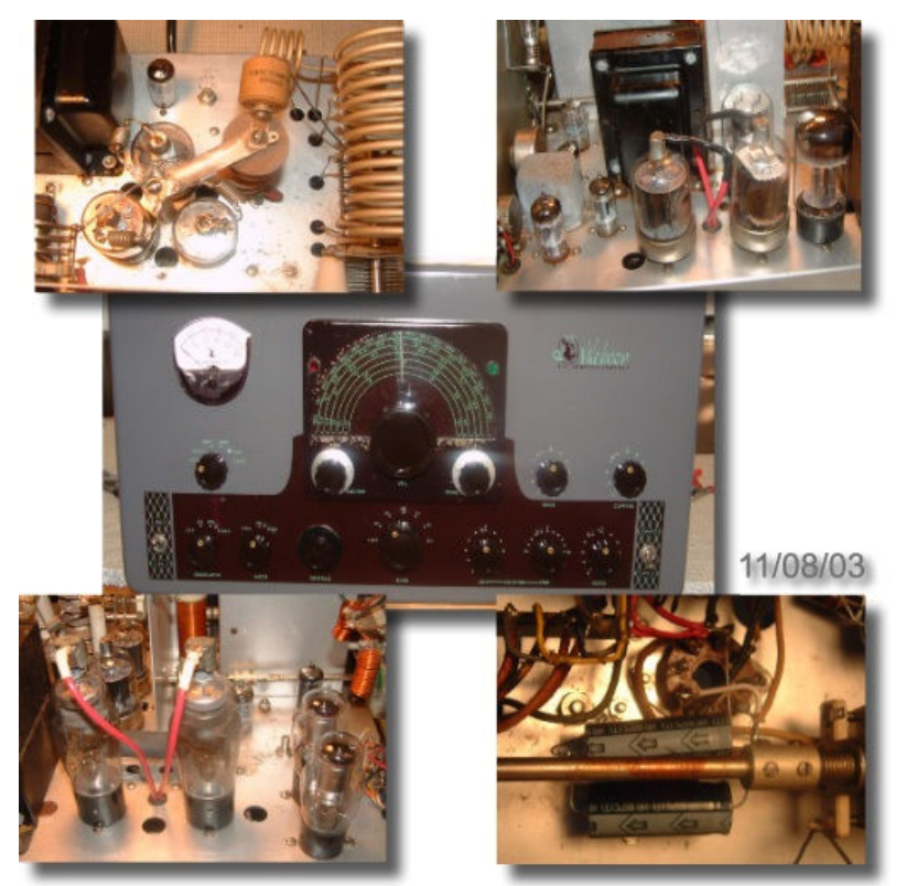
Step 3 - Reassembly:

List of electrolytic capacitors (orange arrows) that were replaced. The .5 mfd paper capacitor looked suspect and was also replaced. The four .1 paper capacitors looked good and were left intact (for now).