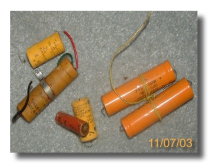
Several old electrolytic capacitors removed from the Valiant